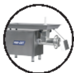
Powerful 3 HP motor