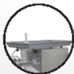
Large stainless steel feed tray