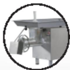
Stainless steel body